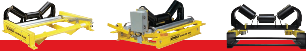
CONVEYOR BELT SCALES

Easy to use, dependable and accurate scales in single to four idler configurations