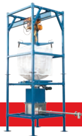
BULK BAG UNLOADERS

Customizable, adjustable, and modular units to fit your process