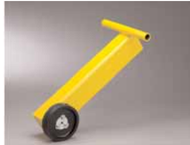
STANDARD SPEED SENSOR

Every Tecweigh® Conveyor Belt Scale is covered by our exclusive five year warranty!