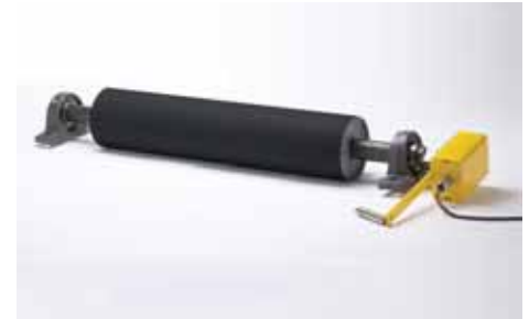
OPTIONAL HEAVY DUTY SPEED SENSOR