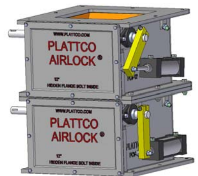
Plattco PCV-1222 shown